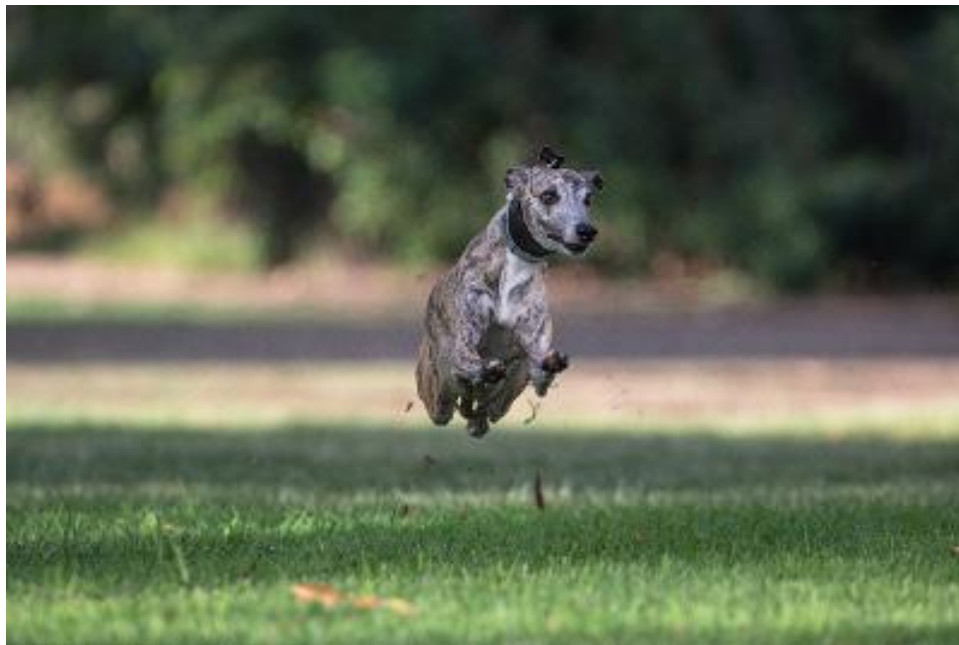
Flying Bookie Joe!

This month's race practice photos can be found: Oct 2022 - agiledogs (smugmug.com)