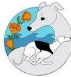
Southern California Whippet Association